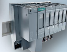
SIEMENS PLC ET 200SP IO